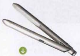
↓ JOHN FRIEDA FOR CONAIR STRAIGHTENING IRON ($50; DRUGSTORES)

This affordable iron smooths unruly hair as well as any pricey iron (we gave it a go). Plus, its ionic technology flattens frizz—and continues to fight it all day.