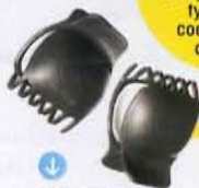
↓ TOPSTYLER ($119; TOPSTYLER.COM)

Gets hair smooth sans silicones (which can make fine hair greasy). Bonus: Thanks to a dirt-repelling compound in the spray, you can wash (and dry) less often.